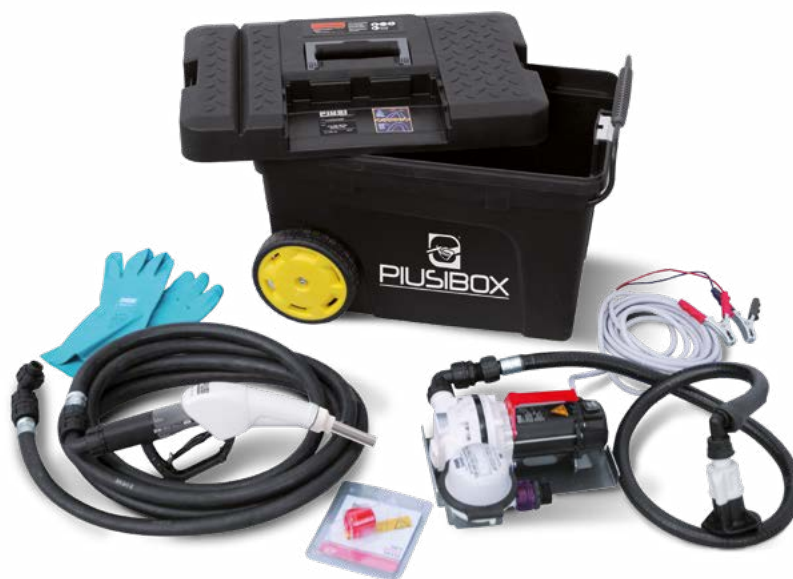
PIUSIBOX FOR ADBLUE®