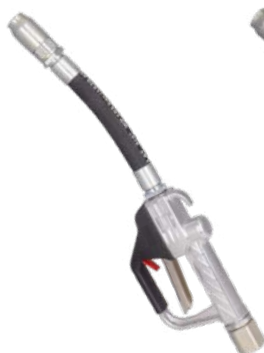
with flexible spout