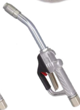
with rigid spout