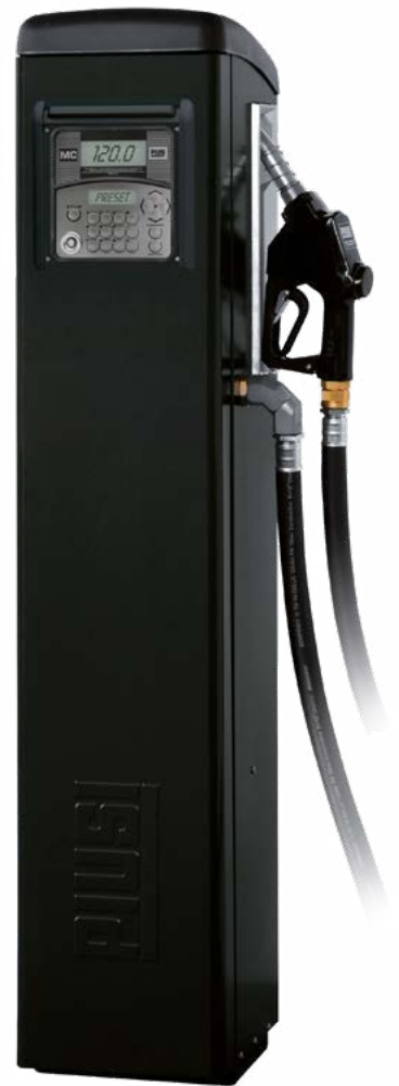
SELF SERVICE MC 2.0