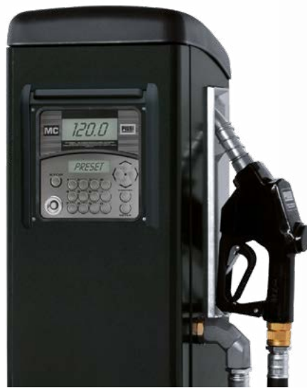
ELECTRONIC METER INTEGRATED