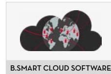
B.SMART CLOUD SOFTWARE