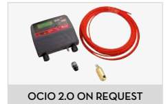
OCIO 2.0 ON REQUEST