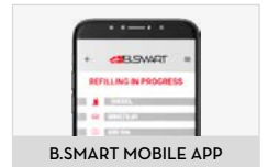
B.SMART MOBILE APP