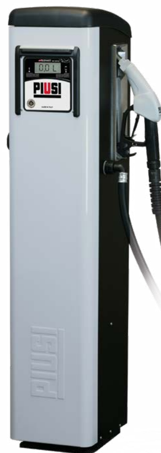
SELF SERVICE B.SMART

Upgrade your MC hardware to B.SMART with KIT UPGRADE SELF SERVICE 1.0/2018