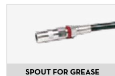
SPOUT FOR GREASE