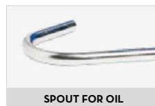
SPOUT FOR OIL