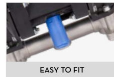
EASY TO FIT