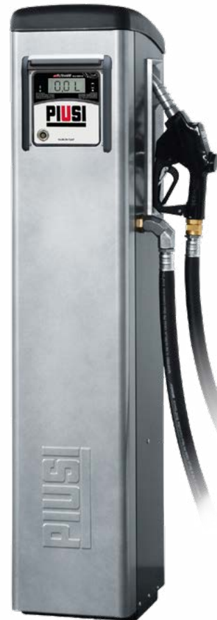
SELF SERVICE B.SMART

Upgrade your MC hardware to B.SMART with KIT UPGRADE 1.0/2018.