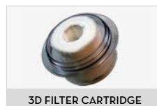
3D FILTER CARTRIDGE